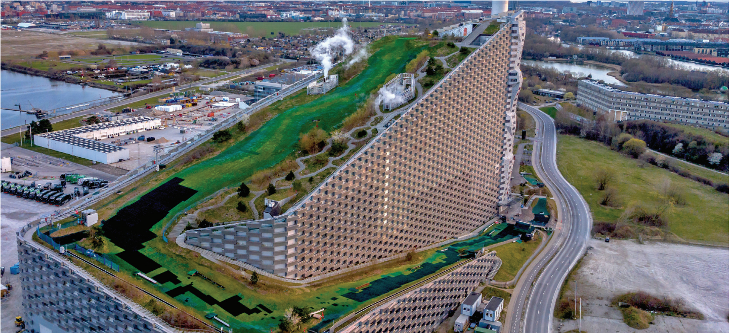
Figure 2: CopenHill clean energy plant with recreational activity on the exterior