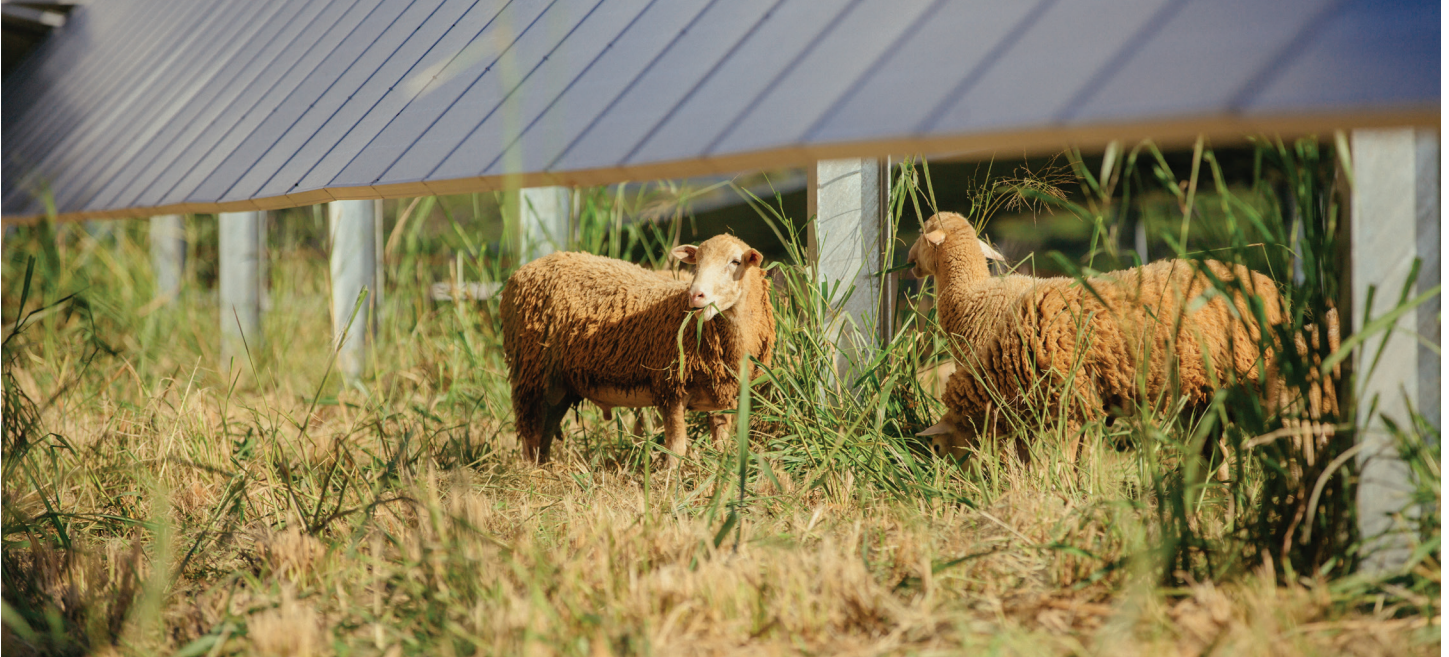
Figure 1: Lamb-scaping in progress at AES Lāwa'i solar site